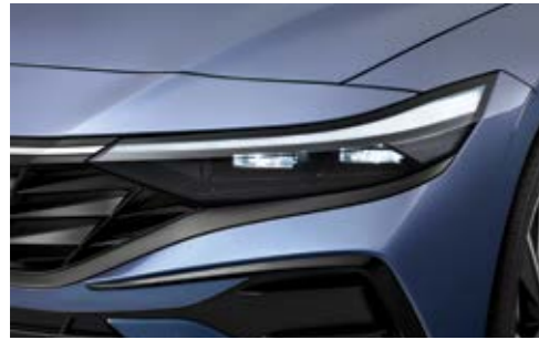
Thin-type Full LED Headlamps