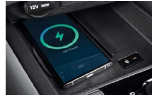
Wireless Smartphone Charger