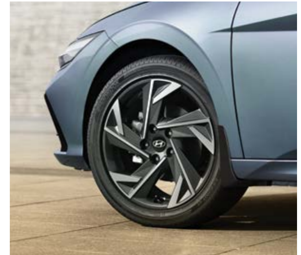
17" alloy wheels & tires