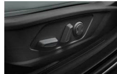
Power Driver's Seat (8-way, lumbar support)