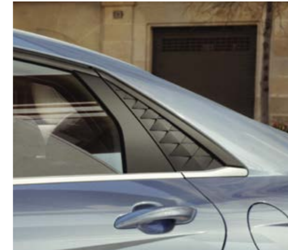
Quarter Glass Cover