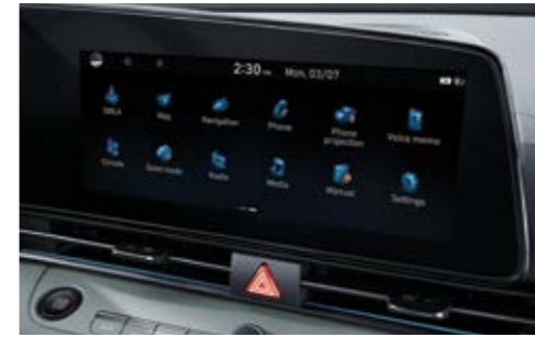
10.25-inch Navigation Display