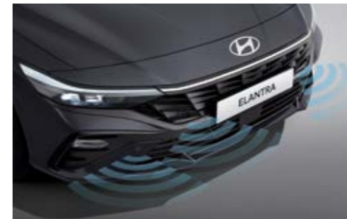
Parking Distance Warning (Forward/Reverse)