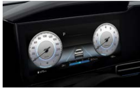
Cluster (10.25-inch color LCD)