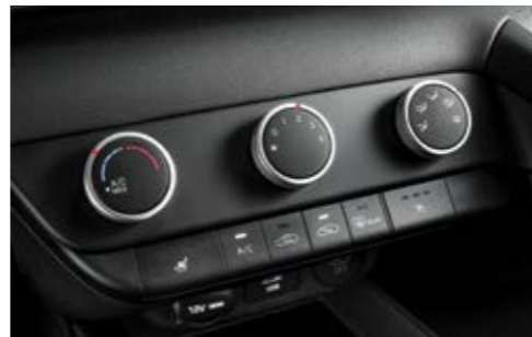
Manual Air Conditioner