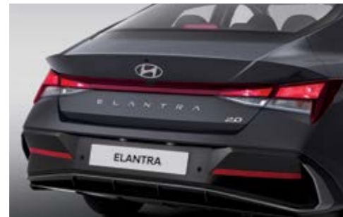
Bulb Rear Combination Lamp