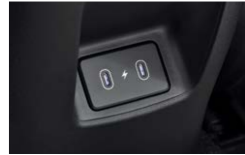
USB-C type Charger (2nd Row)