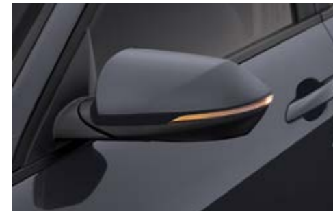
Exterior Sideview Mirrors (heated, power folding, LED turn signal indicators)