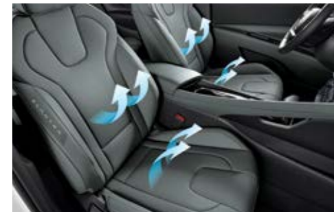
Ventilated Seats (1st Row)