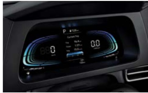
Cluster (4.2-inch color LCD)