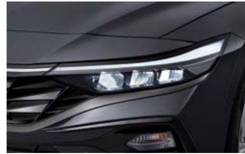
Full LED Headlamps (MFR type)