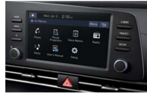
8" Display Audio System (matt, when selecting 4.2" color LCD cluster display)