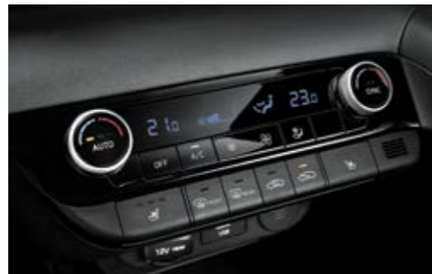
Dual Full Auto Air Conditioner