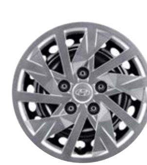
15" Steel Wheel & Wheel Cover