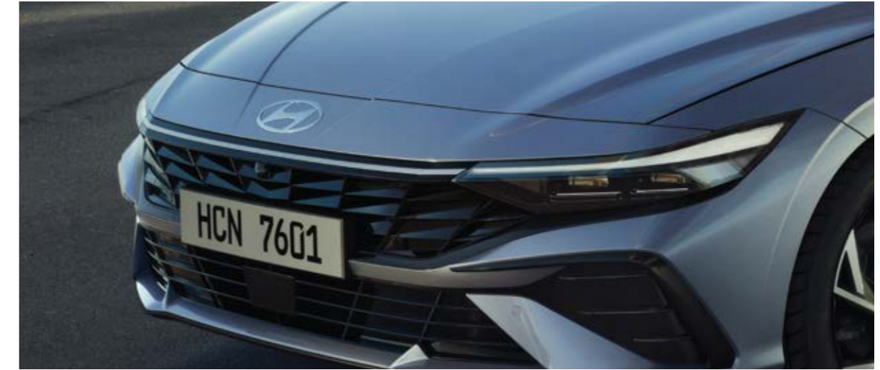
Thin-type Full LED Headlamp