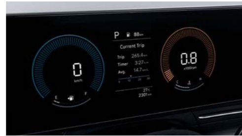
Cluster display (4-inch color LCD)