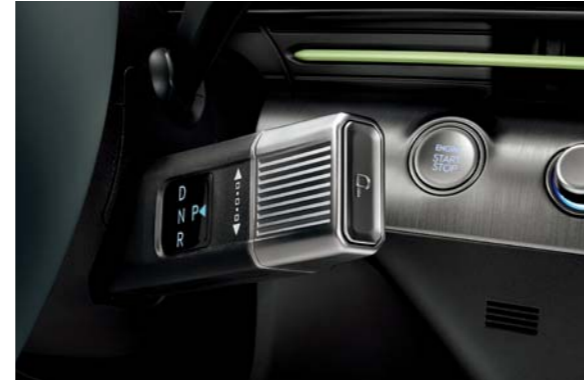
Column-Type Shift by Wire (SBW)