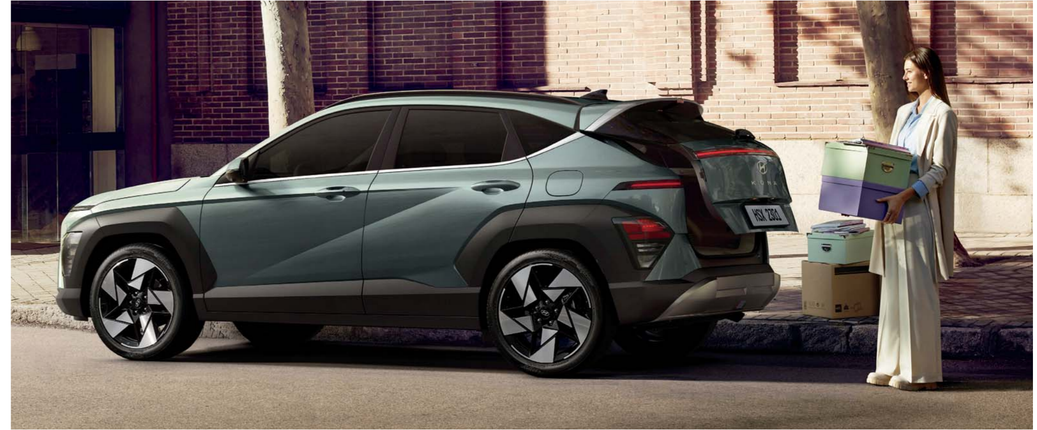
Smart power tailgate - Hands-free smart liftgate with auto-open and adjustable height setting