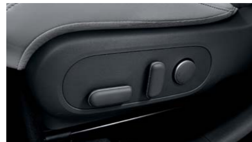
Powered driver seat