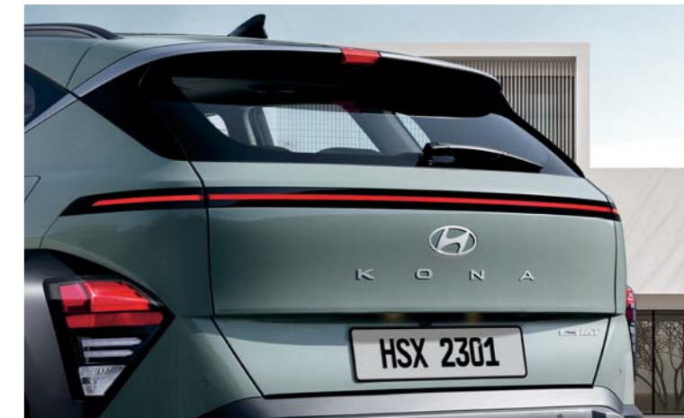
Spoiler Integrated HMSL, rear seamless horizon lamp LED brake lamps, LED turn signal lamps