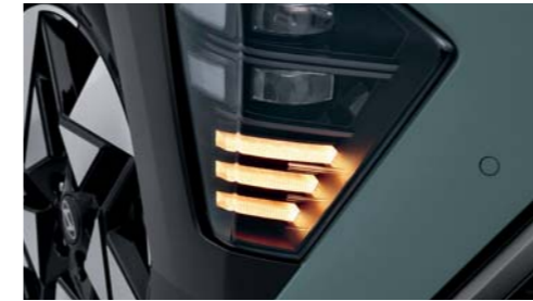
LED turn signal indicators (front/rear)