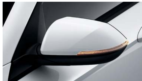
Outside mirror (Heated / Folding / Turn signal indicator LED)