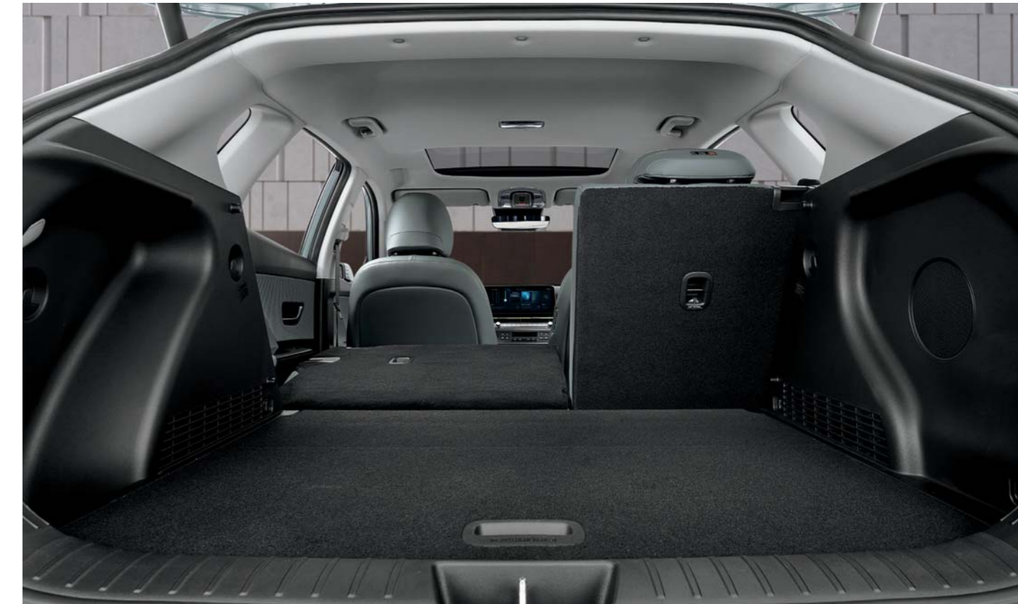
6:4 folding 2nd row seat backs