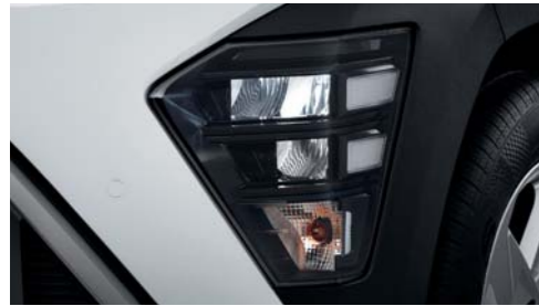
LED Headlamps (MFR)