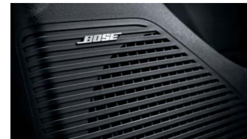
Bose premium audio system