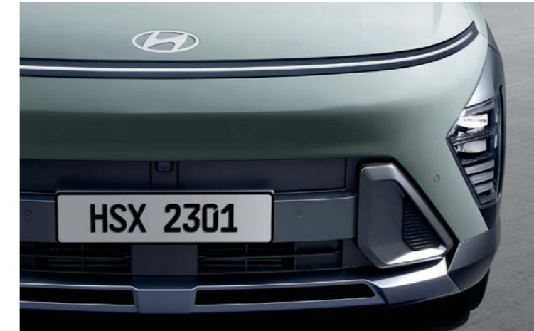
Front seamless horizon lamp, front bumper