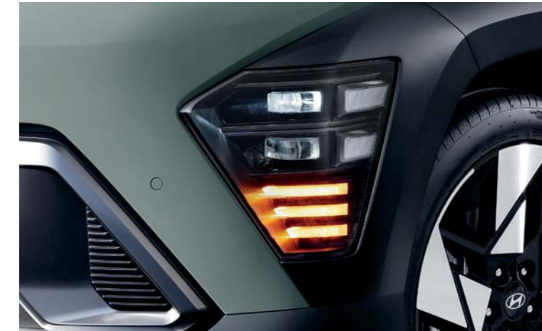
Full LED headlamps (projection type)