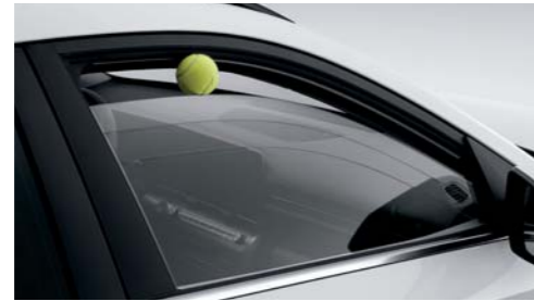
Safety power window