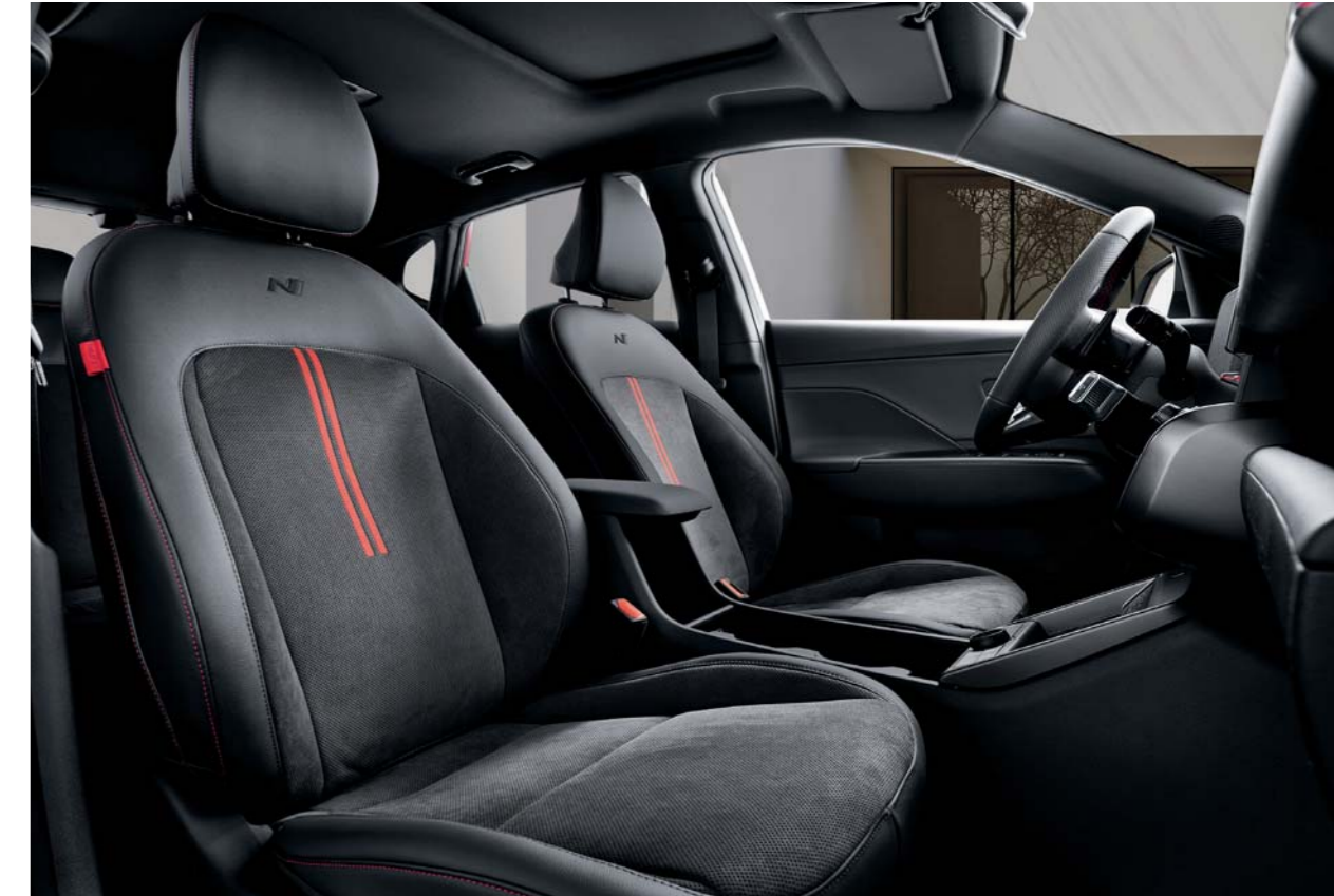
N Line-exclusive authentic leather / Alcantara combination seats