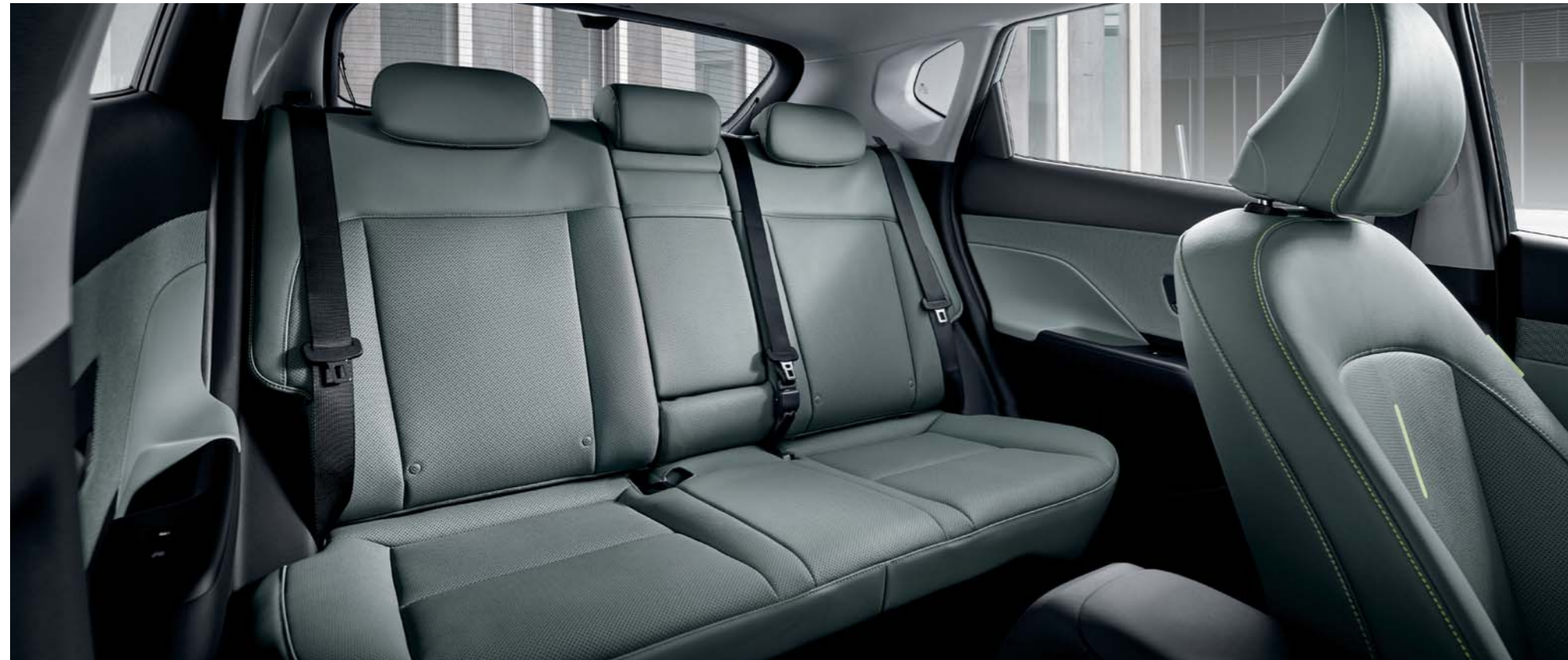
2nd row space

KONA's interior is practical and spacious, with a focus on the comfort of rear passengers and ample luggage space to cater to different lifestyles.