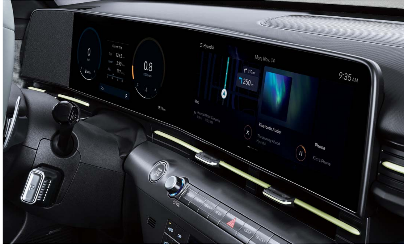
Panoramic display - 12.3-inch integrated dual screen display

The panoramic display - 12.3-inch integrated dual screen display and cutting-edge driver assistance technology offer high-tech convenience and increase user satisfaction in daily use.