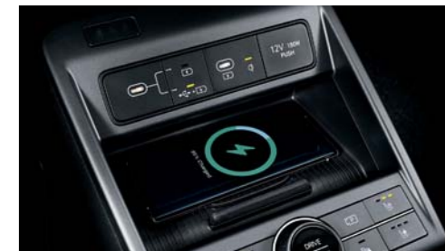
USB-C Data/Charging ports /Wireless charging pad