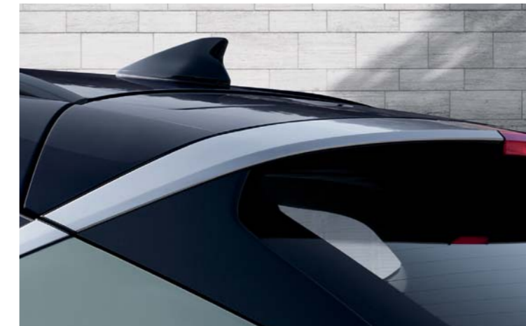
Dual tone roof, sharp connecting chrome line