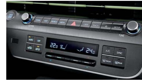
Full auto air conditioning system