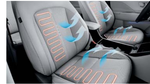
Heated & Ventilated front seats