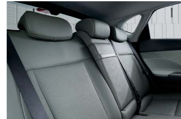
2nd-row seatback 2-step latch