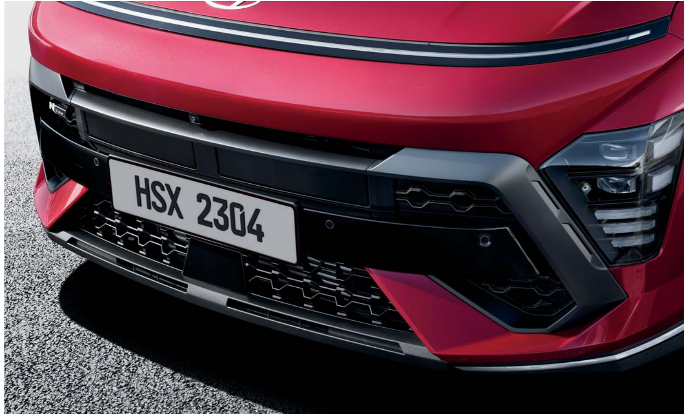
N Line-exclusive front bumper & bumper skirt

The N Line exudes boldness and dynamism, featuring a high-performance exterior design inspired by the renowned high-performance N.