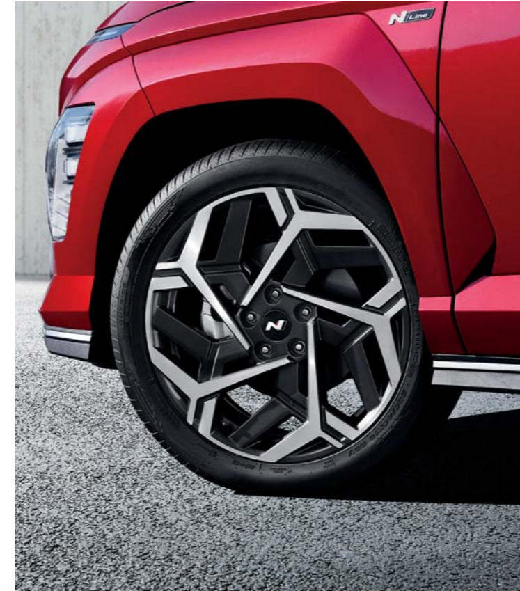
N Line-exclusive 19-Inch alloy wheels / Body-colored cladding