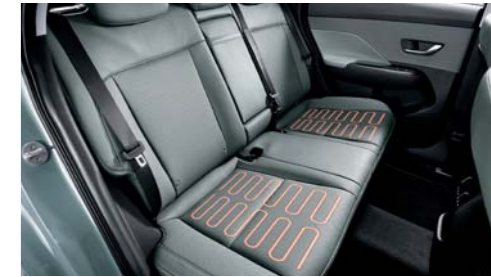
Heated rear seats