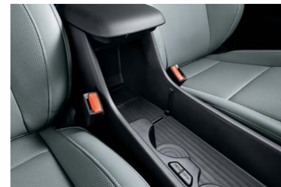
Open console storage (removable bulkhead / rotational cup holders)