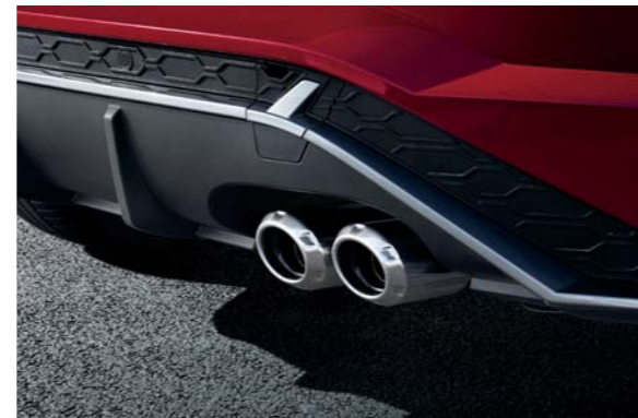
N Line-exclusive single twin tip muffler