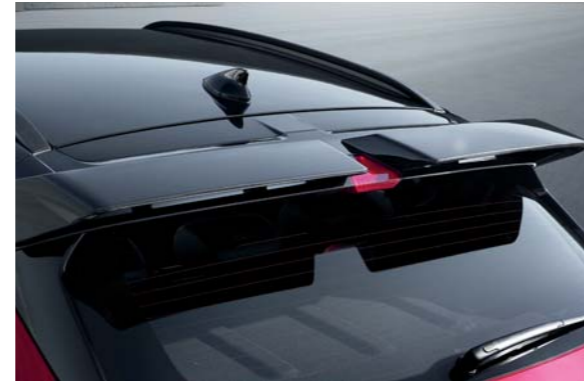
N Line-exclusive wing-type rear spoiler