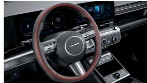
Heated steering wheel